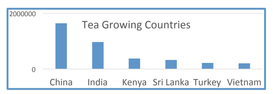
Table-3: Tea Growing Countries

Tea production is one of the main production types regarding the Black Sea Region. In Turkey, annual wet tea yield can range from 1,250 to 1,350 thousand tons depending on climate of the year and agricultural technical precautions. Today, followed by Vietnam, Turkey is the fifth in the World to grow tea after China, India, Kenya, and Sri Lanka.