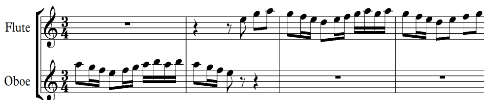
Figure 15. M. Ponce, Concierto del Sur , Allegro moderato , mm 2-5

In Figure 15, four quarter notes were observed at the last beat of the measures 2 and 4 which was also seen in Rodrigo's fandango . This structure is assumed to be one of characteristic variation of fandango 's rhythmic pattern. Figure 15 consists of a 12-beat structural cycle with ternary rhythm as mentioned at introduction part. The same situation also observed in Allegro moderato : Measure 17-20 (violin), 52-55 (violin), 171-174 (violin), 184-187 (guitar), 226-229 (flute-violin), 288-293 (violoncello-clarinet-violin), 405-408 (guitar). Andante : Measure 2-5 (guitar), 99-102 (guitar); in addition to the given samples, the rhythmic structure of fandango has been used in various ways throughout the 1 st and 2 nd parts of the concerto as mentioned at introduction part.