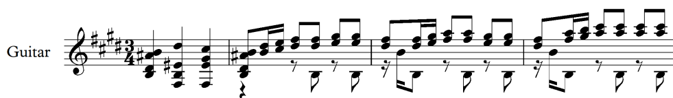
Figure 7. J. Rodrigo, Fandango from Tres Piezas Espanolas , mm 5-8

In the Rodrigo's Fandango was noted two rhythmic patterns as seen in Figure 7 and 8. In a metric of 3/4, it is seen that the rhythmic pattern of letter A (Fig. 2) used in bars 6 to 8 (Fig. 7) was diversified with the inclusion of semiquavers in bar 28-29 (Fig. 8).