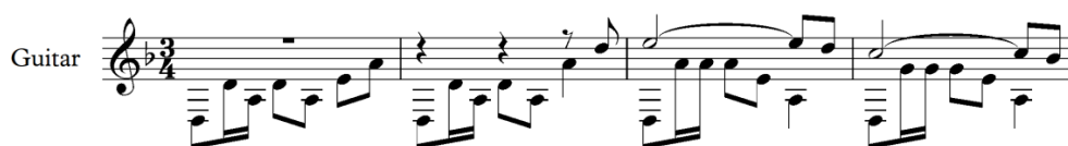
Figure 11. M. Ponce, Variations sur "Folia de Espana" et Fugue , Var. 12, mm 1-4

Figure 11 represents the Variations sur "Folia de Espana" et Fugue which was composed in Paris between 1928-31 at the request of Andres Segovia. It is an important work by one of the most productive composers for the guitar in the twentieth century. The work consists of 20 variations and a fugue. The Variations sur "Folia de Espana" et Fugue is not much preferred by guitarists because of its strict technical requirements, complex musical construction and its extent. The musical elements (harmony, melody, rhythm and phrasing) that the composer used must be observed correctly by performers to understand relationship between theme and variations (Ingwerson, 1996: 11). In variation 12, rhythmic character of the first bar, shows similar rhythmic patterns with B (Fig. 2). This rhythmic character also used in measure 11 and 26 in variation 12.