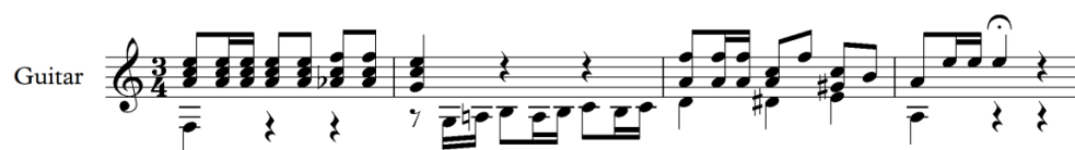
Figure 14. M. Ponce, Variations on a Theme of Cabezón , Var. 2, mm 13-16

The last guitar work by Ponce is the Variations on a Theme of Cabezón (Fig. 14) written in 1948. In this work, Ponce used the structural plan of Variations of the Folías which he wrote 19 years ago (Otero, 1994: 66). This piece was the last work he wrote before died and he dedicated to Dr. Antonio Brambilla – friend and confessor of Ponce (Alcazar, 2000: 297). It is consist of six variations and fughetta. Throughout variation 2, which is written 3/4 meter, the rhythmic character shows similar features given in B (Fig. 2).