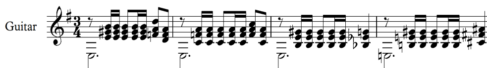
Figure 13. M. Ponce, Vespertina , mm 59-62

Vespertina , one of the shortest works for guitar by Ponce, reflects impressionist style. It was written in Mexico, in 1946. The rhythmic character of first two bar exemplified in Figure 13 is similar to C (Fig. 2).