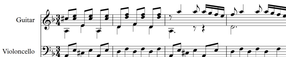
Figure 5. L. Boccherini, Quintet no. 4 in D major, Grave assai-Fandango, mm 22-25

The third example of this study of the fandango 's rhythmic patterns used by classical guitarist and composers is the Spanish composer Dionisio Aguado's (1784-1849). The composer preached the nationalist musical movement of European the work Fandango Variéé for Guitar , composed in the 1830s, the use of the rhyme structures of fandango clearly establishes the Spanish national character. The Fandango Variéé was conceived in a classic style, in three clearly defined sections – Adagio (introduction), Allegro vivace ( fandango ) and Allegro (coda) – being the fandango the prominent part of the work (Sougoniaev, 2017: 13). In the fandango movement is clearly seen the polyrhythmic style defended by Goldberd and Piza (2016: 140): written in 3/4, the dot quarter in the bass gives to the music the original fandango 's pulsation of 6/8.