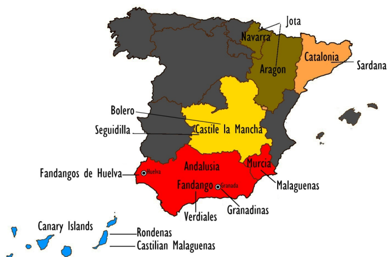
Figure 1. Regional dances of Spain map (Barut, 2019)

Because of the neighborhood of the region, it is possible to note also musical proximity between them. When rhythmic motifs of bolero , seguidilla and fandango are placed side by side, there are clearly homogeneities.