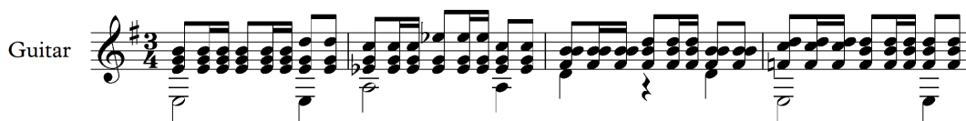
Figure 10. M. Ponce, Theme varie et Finale , Var. 1, mm 1-4

Theme Varié et Finale , written in 1926, was the first significant work composed in Paris due to close friendship with Segovia (Manderville, 2006: 12). It consists of theme, six variations, and finale part. Variation 1 was written in the 3/4 meter and it was the same as the rhythmic pattern mentioned in C (Fig. 2). Also, in this variation, the rhythmic character continued throughout variation 1 as observed in Figure 10.