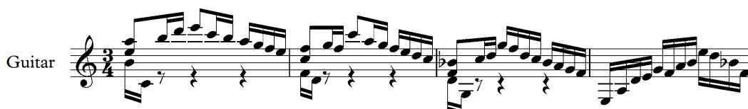
Figure 9. M. Ponce, Prelude A minor , mm 13-16

The Prelude A minor written in 1925 shows impressionist tendencies. The use of modality and the whole tone scale in the work is the most prominent feature of this piece (Alcazar, 2000: 41). The rhythmic character as shown in figure 9 shows similar features in G (Fig. 2).