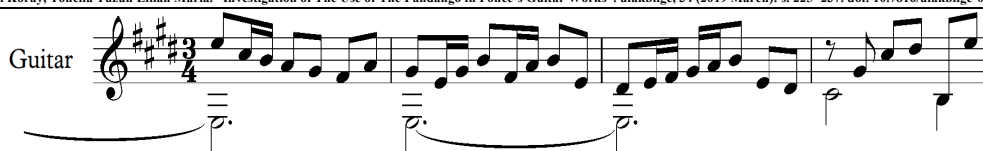
Figure 12. M. Ponce, Prelude E Major , mm 2-5

Vespertina , one of the shortest works for guitar by Ponce, reflects impressionist style. It was written in Mexico, in 1946. The rhythmic character of first two bar exemplified in Figure 13 is similar to C (Fig. 2).