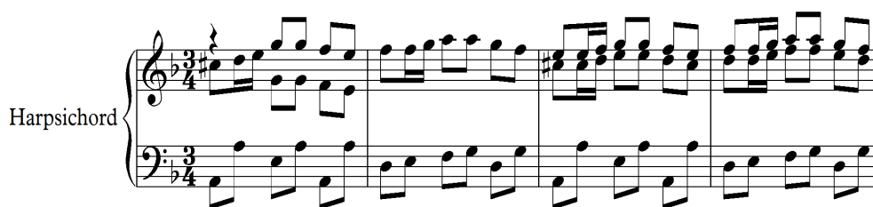
Figure 3. D. Scarlatti, Fandango del Signature Scarlatti , mm 10-13

For example, in the Baroque Period, Domenico Scarlatti (1685-1757) was one of the earliest examples of a foreign composer who assimilated Spanish influences and combined them into his own works (Ramirez, 2013: 19). Italian by citizen, he spent the last thirty years of his life in Spain, that way, undoubtedly, the specific rhythmic elements of the Spanish dances were external factors that entered in Scarlatti's musical repertoire.