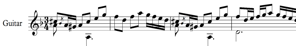
Figure 6. D. Aguado, Fandango Variéé , Allegro vivace , mm 3-6

The third example of this study of the fandango 's rhythmic patterns used by classical guitarist and composers is the Spanish composer Dionisio Aguado's (1784-1849). The composer preached the nationalist musical movement of European the work Fandango Variéé for Guitar , composed in the 1830s, the use of the rhyme structures of fandango clearly establishes the Spanish national character. The Fandango Variéé was conceived in a classic style, in three clearly defined sections – Adagio (introduction), Allegro vivace ( fandango ) and Allegro (coda) – being the fandango the prominent part of the work (Sougoniaev, 2017: 13). In the fandango movement is clearly seen the polyrhythmic style defended by Goldberd and Piza (2016: 140): written in 3/4, the dot quarter in the bass gives to the music the original fandango 's pulsation of 6/8.